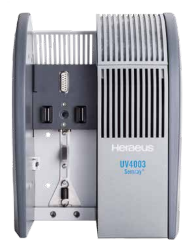
Semray® UV4003-5 Semray® UV4003-2