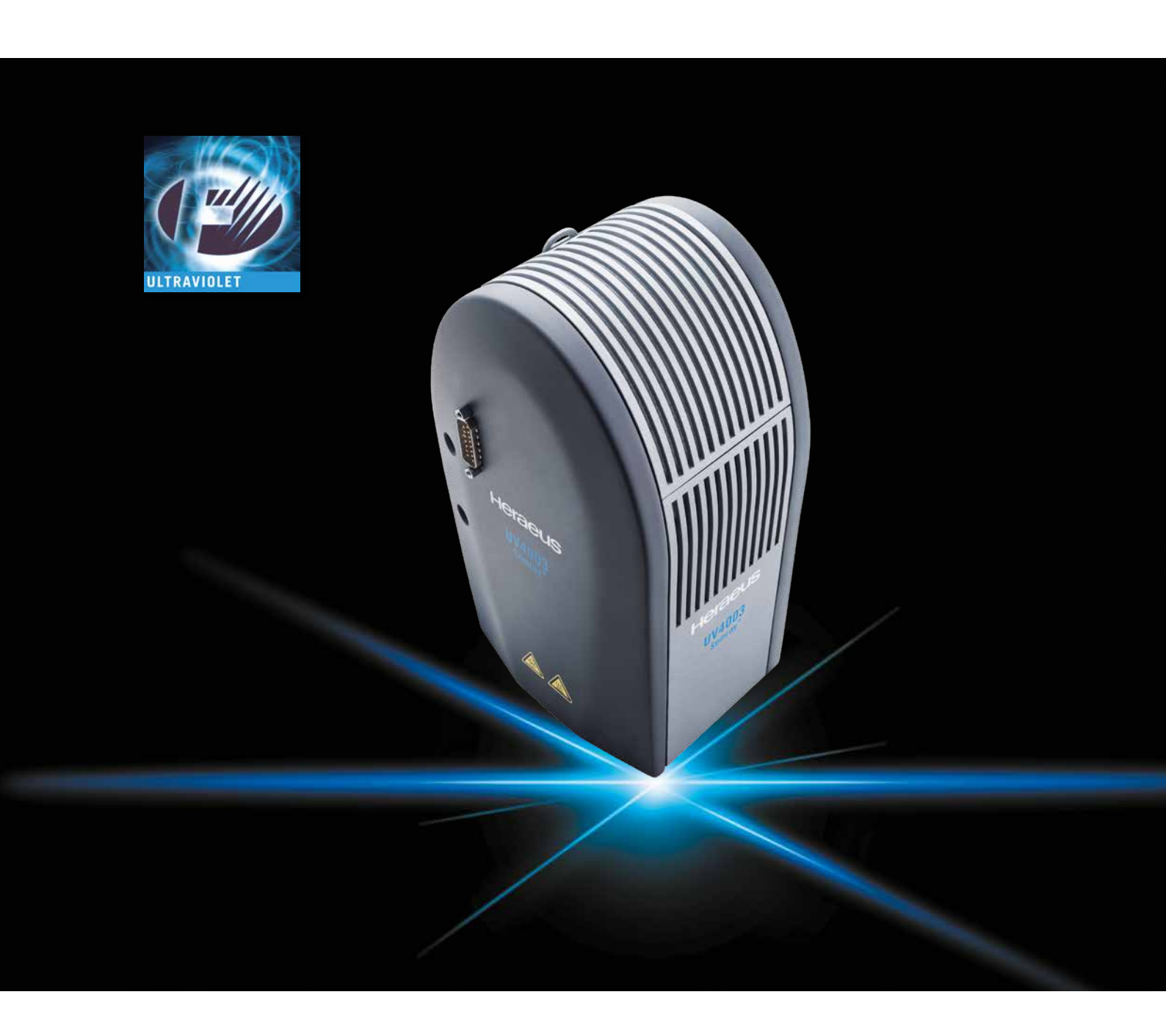
Semray ® The UV LED Plug & Play Revolution. Complexity made simple.